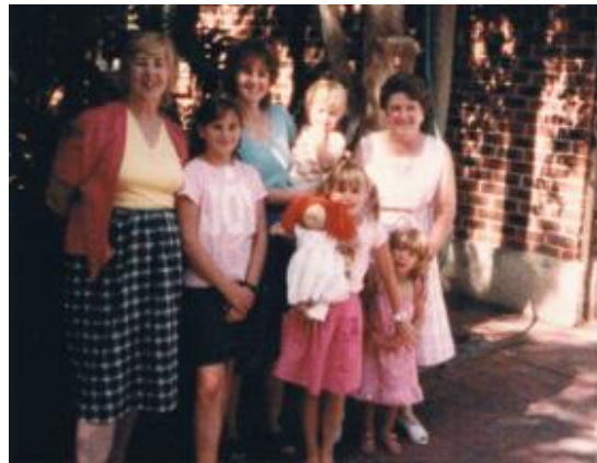
Christmas Holiday at Mum's, 1987.