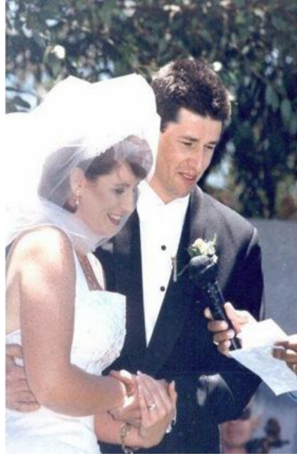
Our Wedding Day