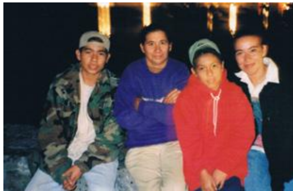
Host Family in Mexico