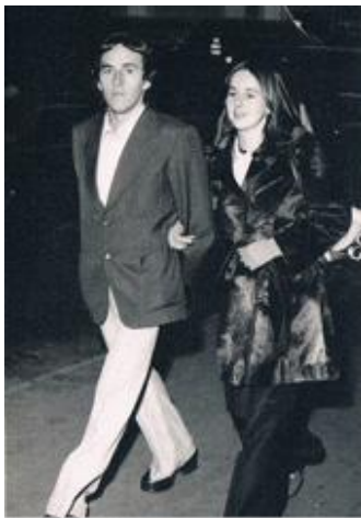
Dad and Mum, 1974