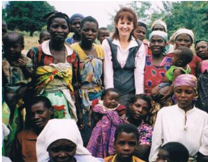
Mkoko village, Malawi