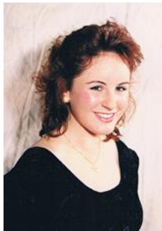
High school ball, age 16.