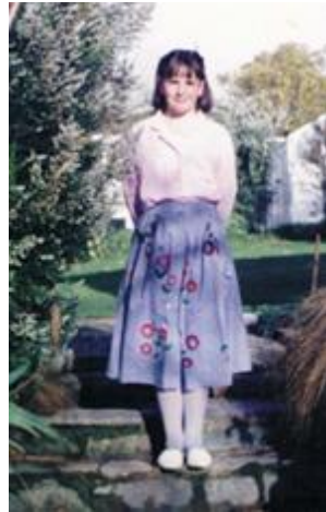
Holiday with my Aunt