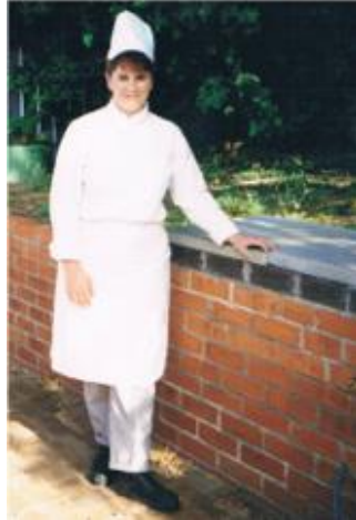
Graduated from Cooking School