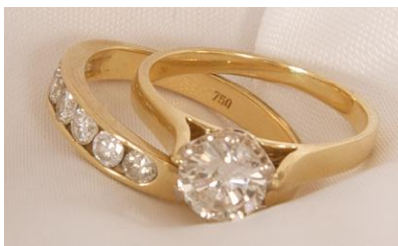
Veronica's Wedding Rings