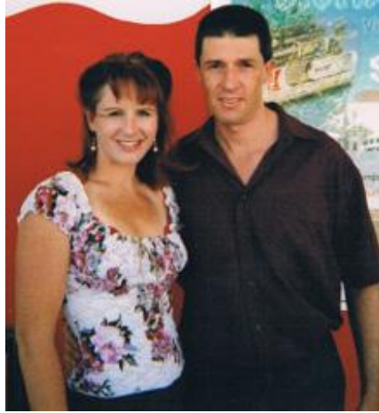
Off to Africa!