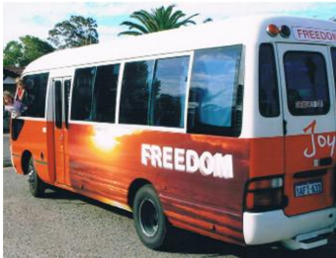
Our Freedom Bus